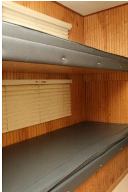
Bunks In Hall